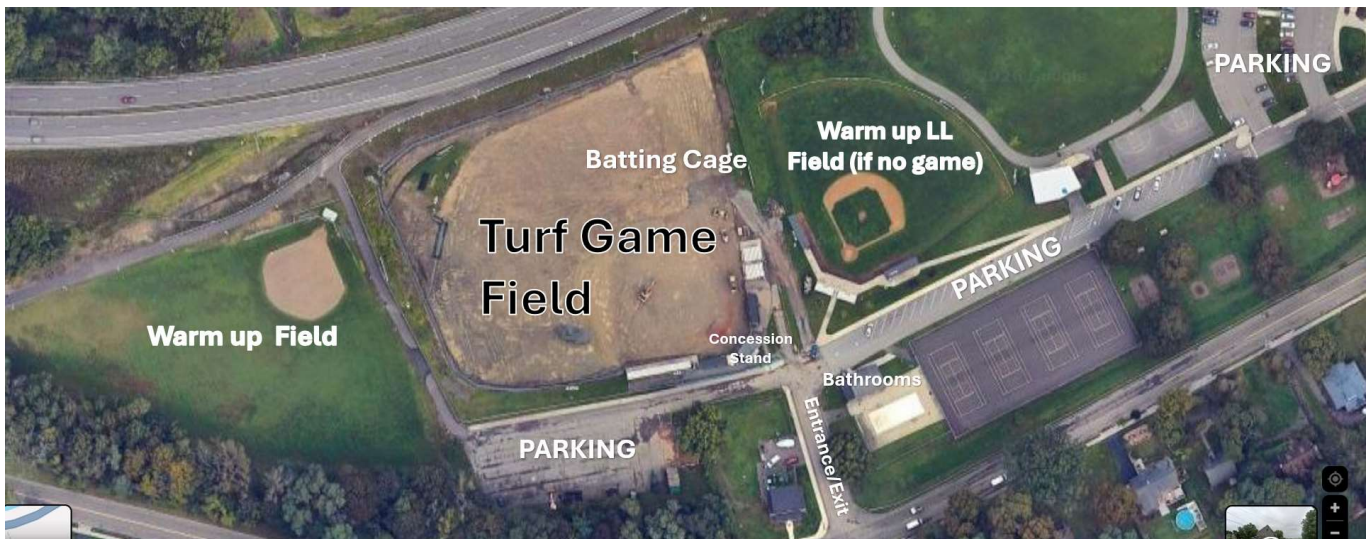
Overhead of Conlon Field at MacArthur Park